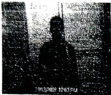
Ist Party न्यासकर्ता

Reg. No. 11933 Reg. Year 2009-2010 Book No. 4